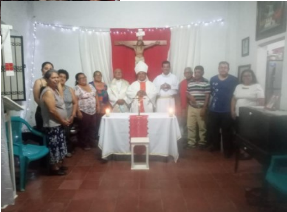
Spiritual Mission Retreat at Santa Cruz, San Salvador