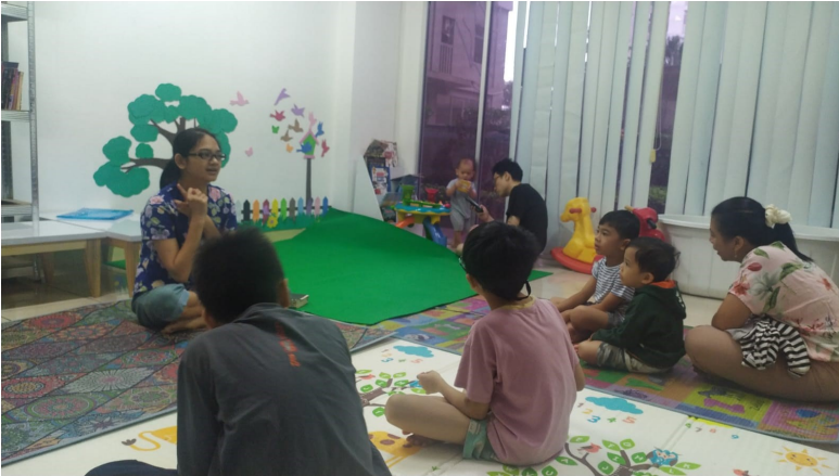
Renting this unit 7 days a week allows PAC to open a children's outreach in this huge apartment and shopping complex. The members have taken great care in the renovation and decoration of this room.