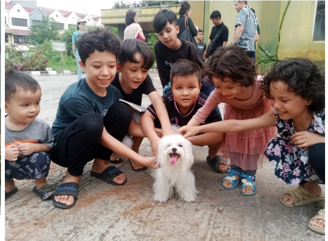
Our old dog Tini visited the refugee camp with her new owner to the delight of the children.