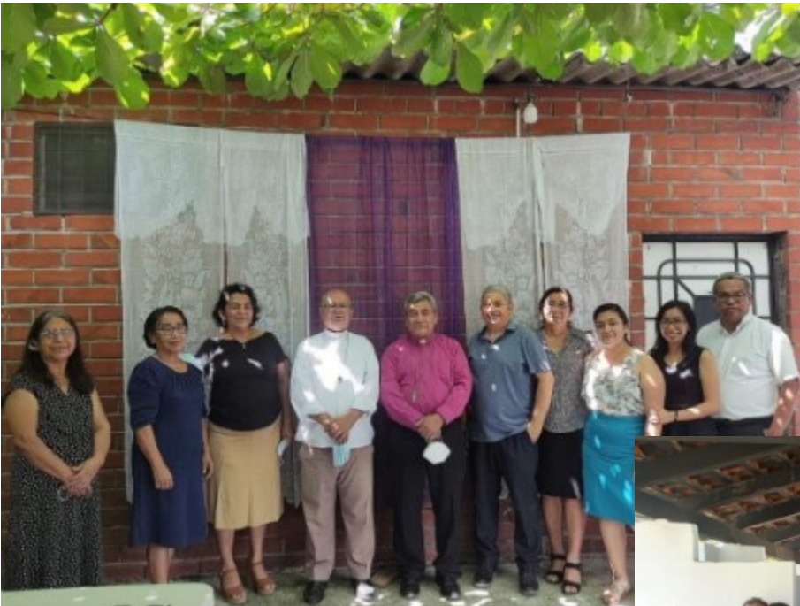
Spiritual Mission Retreat at Enero, San Salvador 2023