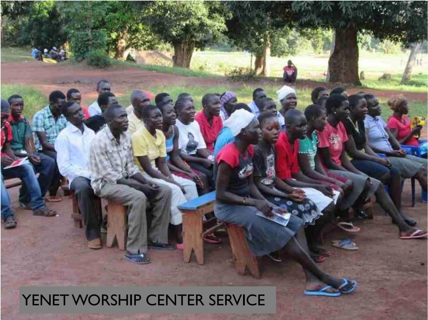
YENET WORSHIP CENTER SERVICE