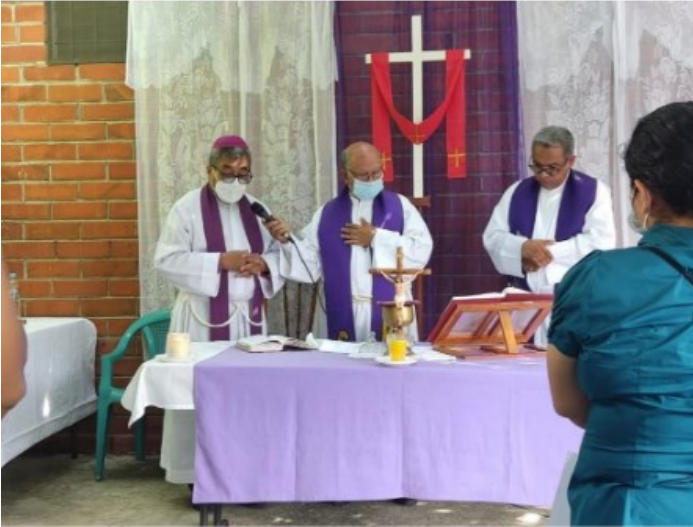
Holy Eucharist of Synod in October 2023 at Quezltepeque, San Salvador