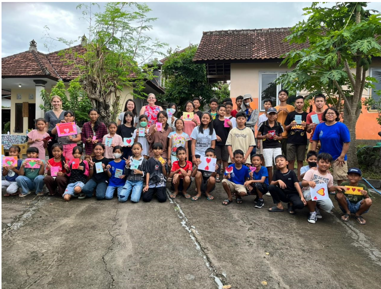
Just before COVID a young woman from Red China was invited to a PAC outreach during her last day on a Bali vacation. There God began to open her heart. Through a series of events both she and her mother became born again. Here, three years later, she and her mother donated their vacation to working at Ruma Baca, a related ministry that serves the village children of Bali through literacy development and the sharing of the good news.