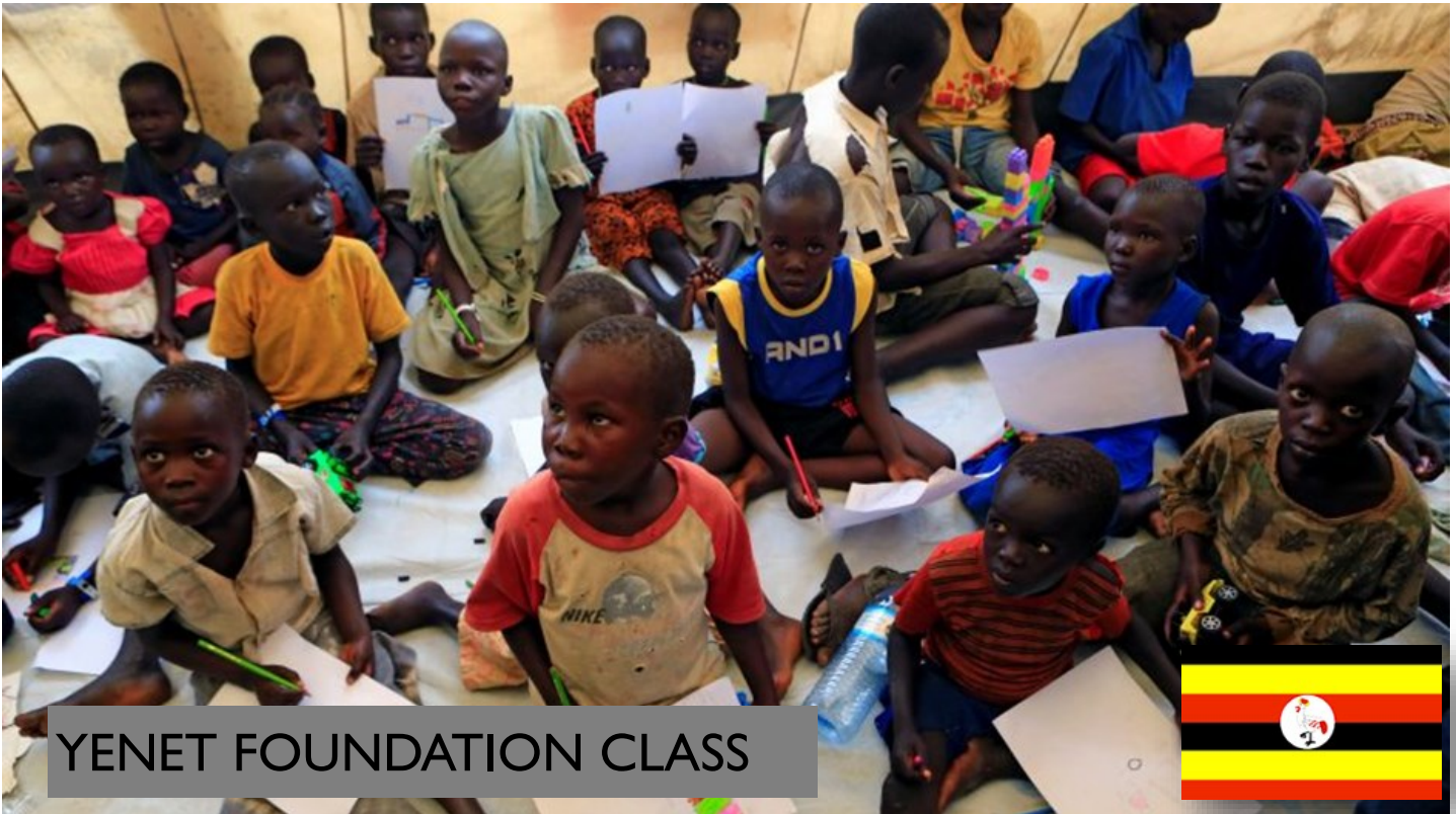
YENET FOUNDATION CLASS