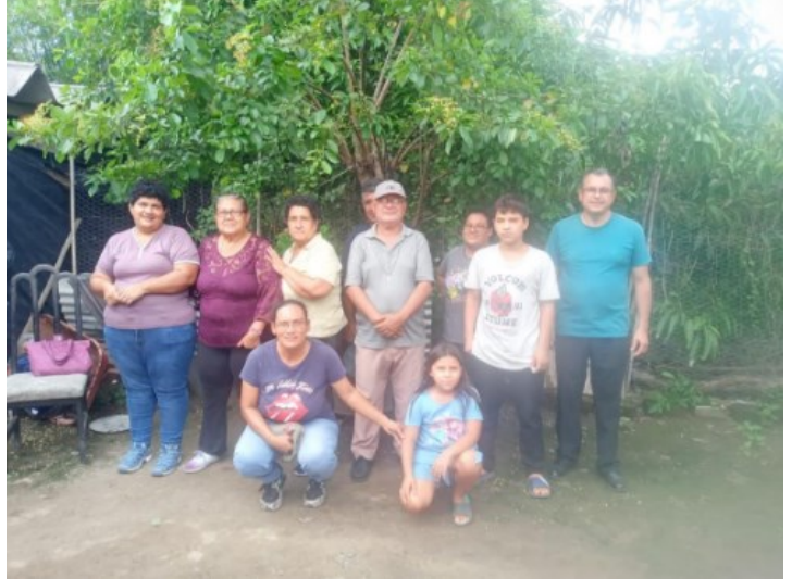
Members at Synod