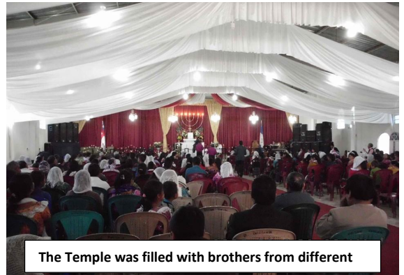
The Temple was filled with brothers from different

And when we arrived so looked the temple, despite a delay of more than an hour , we took , by the poor condition of the road ; a lot of brothers were waiting for us with great joy .