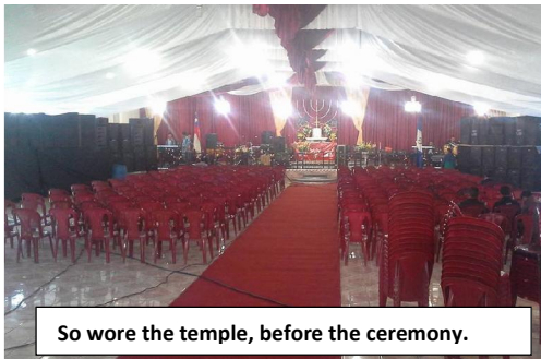
So wore the temple, before the ceremony.

While our brothers of the host parish had so carefully prepared the Temple.